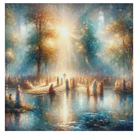
Lyrics As I went down in the river to pray, Studying about that good old way, And who shall wear the starry crown, Good Lord, show me the way.

Many musicologists consider these two classic American melodies the heart and soul of the hopes of enslaved persons. The Shoreline Chorale's performance of this composition is our acknowledgement of that history, and also our pledge that we will "follow the way" as we ourselves "go to that gospel feast where all is peace."