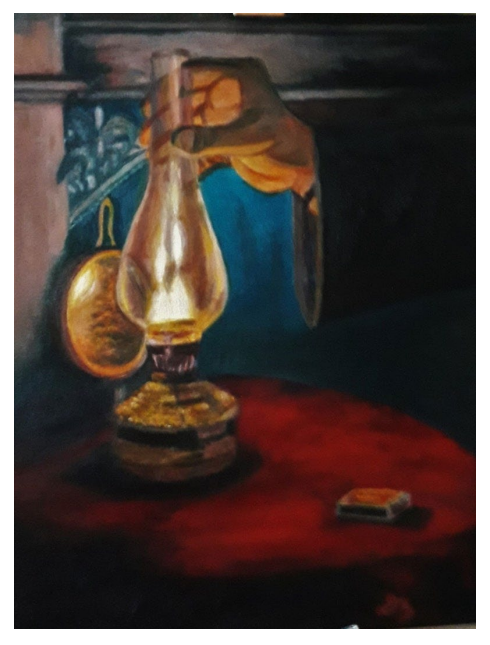
<u>Lyrics</u> Keep your lamps trimmed and burning, The time is drawing nigh.

This rousing anthem encourages us all to not get weary, to keep our lamps lit, because our time is drawing nigh; our concert theme is once again convincingly held in front of us!