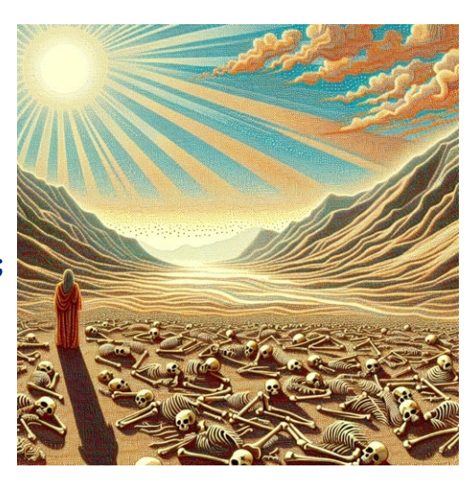
Ezekiel 37:1-14 The Valley of Dry Bones

Dem bones dem dry bones! Now hear, hear the word! Now hear the word of the Lord! Yeah!