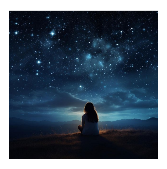
Lyrics Ad astra per aspera! To the stars... Sursum, sursum, sursum.

Ad Astra is taken from the State motto of Kansas, "Ad astra per aspera" ("To the stars, through hardship"). This anthem, highly rhythmic in both accompaniment and voices with independent vocal lines, simply radiates energy with a message of hope and empowerment: to the stars through difficulties! Look upward, move forward, leave all cares behind!